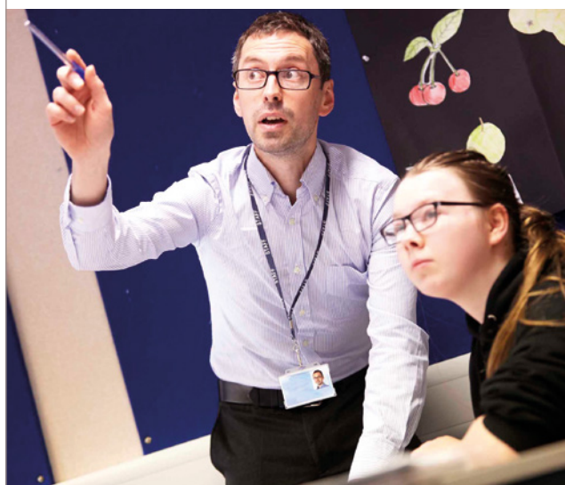
An employability lesson at Derwentside College

In summary, as a college we have found that the combination of extra time spent with learners with SEND, investing in staff with extensive SEND experience and adapting and creating careers resources specifically for learners with SEND has helped us to meet the needs of all of our learners in the college as they progress into the world of work.