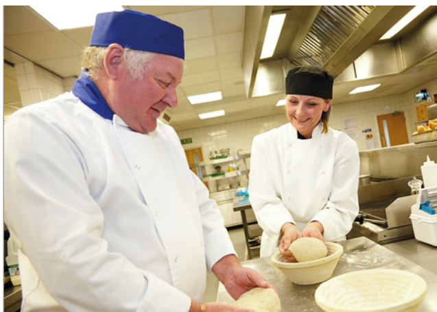
A catering course at Derwentside College