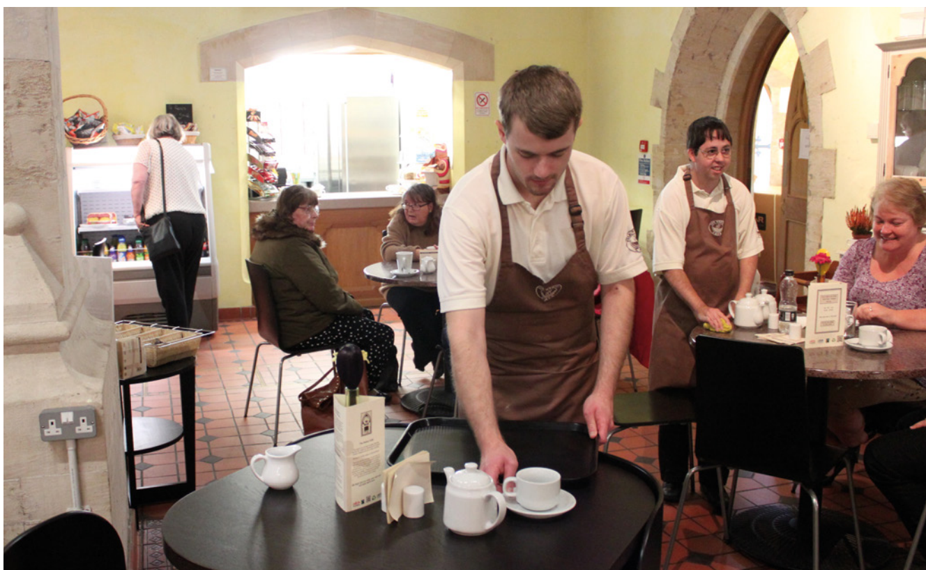
Students from Catcote Academy working at The Vestry café

Within the Steps programme, we are working in partnership with the Joseph Rowntree Foundation and Hartfields Retirement Village, based in Hartlepool, to develop our students' soft skills and help them gain further knowledge of the labour market. Students attend Hartfields one day a week to access three different work areas per academic year. Departments involved include maintenance, domestic support, horticulture, retail, catering and administration.